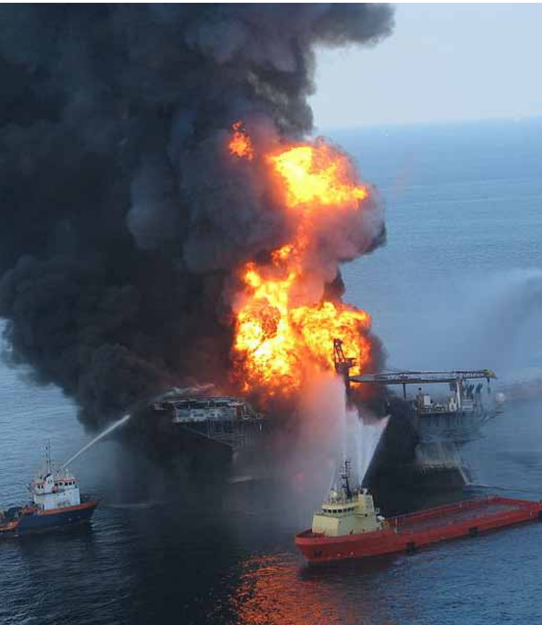
Fireboats try to put out the fire at the site of the Deepwater Horizon explosion that left 11 dead and led to the worst oil spill in U.S. history.

Despite a recent push to move away from oil consumption due to the profound environmental, national