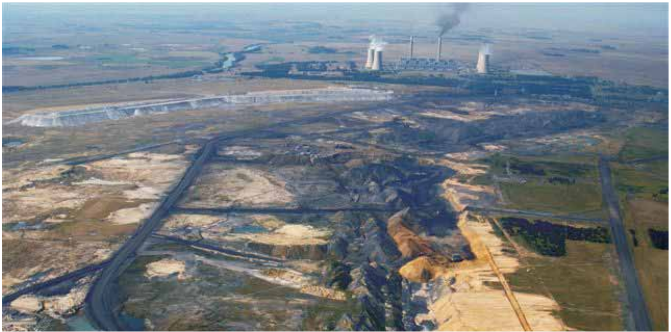
Destruction of land adjacent to a coal plant run by South African utility Eskom, which received a loan from the World Bank in 2010 to build one of the world's largest coal plants.

the national level, the Overseas Private Investment Corporation and the Export-Import Bank of the United States are examples of government-supported agencies that subsidize U.S. companies to invest in risky foreign markets by providing them direct and low-cost financing and insurance. While intended to help American small businesses compete in the global marketplace, these agencies actually provide subsidies to large, very profitable private companies like ExxonMobil.