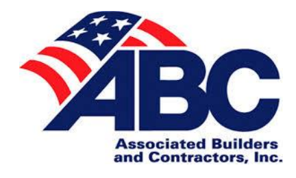
Associated Builders and Contractors, Inc.