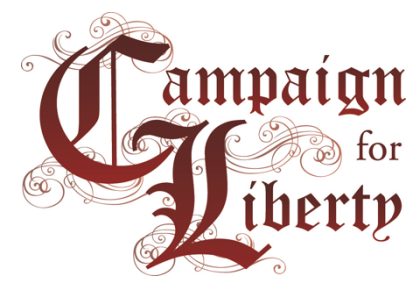
Campaign for Liberty