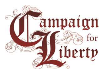
Campaign for Liberty